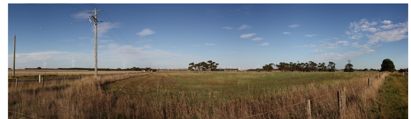
Predicted view of the Willatook Wind Farm looking ESE from the intersection of the Woolsthorpe-Heywood and Hamilton-Port Fairy Roads.

Wind Prospect has begun to gather detailed site information regarding the project area and the impact assessment and would like to share this information with the local community. Two open days will be held at the end of October/early November to provide an opportunity for the community to learn more about the proposed project and to provide input to the development process. The events will be advertised locally in early October, or if you are interested in attending the open day you can contact Wind Prospect to be added to the mailing list. We very much look forward to meeting more of the local community and hearing your views.